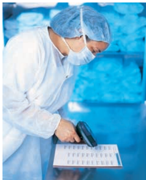
Identification of receiving unit