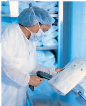
Registration of products to be distributed