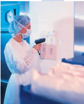
Steriliser and cycle type identification